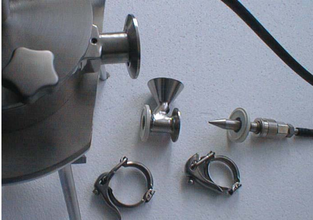
JMRS 80 SQ Injector parts with hopper