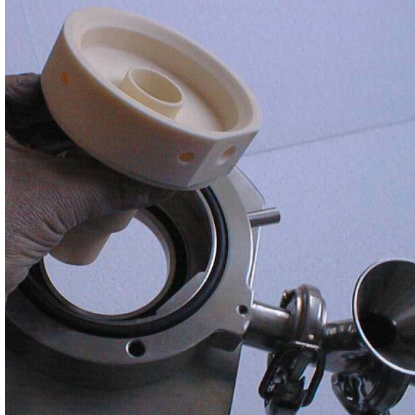
JMRS 80 SQ: Desmanteling ceramic housing