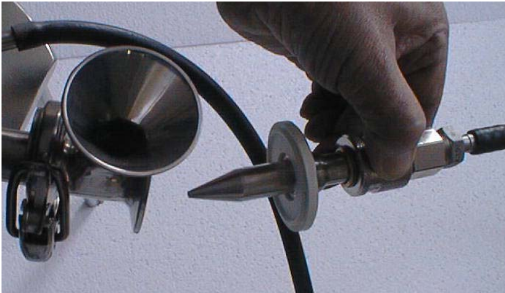
JMRS 80 SQ: Taking off the injector