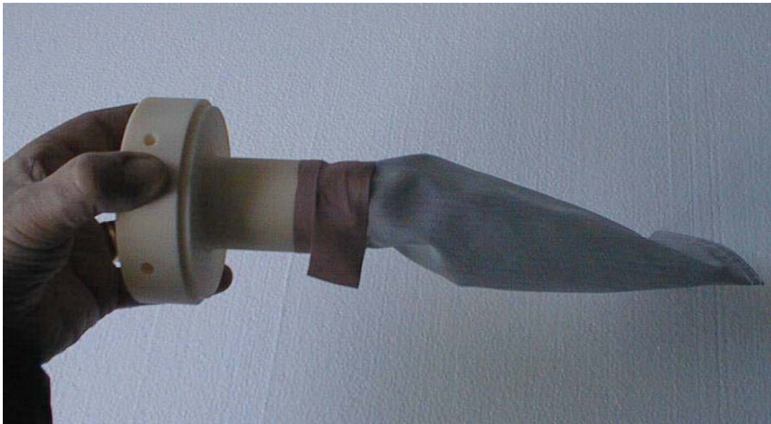
JMRS 80: Ceramic housing with two air-nozzles (total five off) and filter bag